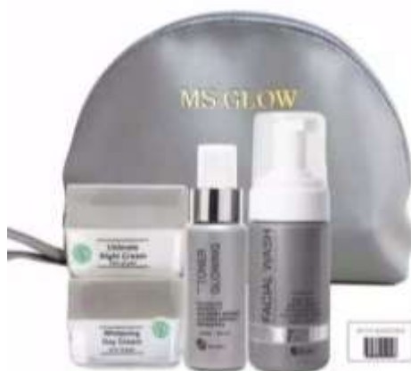
Figure 2. MS GLOW Products

The phenomenon of beauty trends in society has led to the emergence of a view of beauty that is used as a standard for a woman to be said to be attractive. Skincare is a series of skin treatments that can care for health and beauty. The use of skincare products is the most popular thing, but some products have to face tough competition in marketing because of the many products available to the public. Many types of skin care products exist among the many beauty industries today. One of them is a product from MS GLOW. MS GLOW is a beauty brand in one line under the auspices of PT. Beautiful Indonesian Cosmetics. Established in 2013, MS GLOW is an abbreviation for Magic For Skin to describe a glowing product in Indonesia ( Liputan 6.com, 2020 ). MS Glow, founded by Maharani Kemala and Shandy Purnamasari.