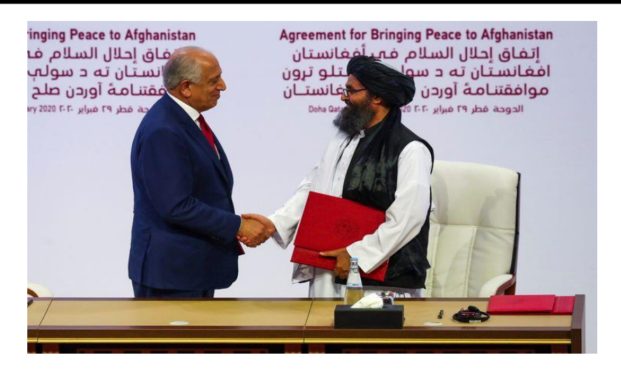
Figure 1. US Side Shake with the Taliban Source: (Utomo, 2020)

Indonesia's role as a non-permanent member of the UN Security Council in Assisting the Resolution of Conflict in Afghanistan for the 2019-2020 period Khoirunnisa & Budiman