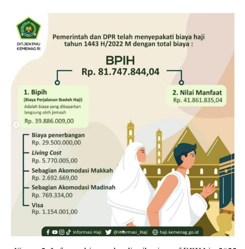
Figure 2. Infographic on the distribution of BPIH in 2022

From the summary submitted by the Director General of Hajj and Umrah Implementation, it was found that problems if the Hajj Bipih is not increased in 2023, then (1) The composition of the percentage of the benefit value is not balanced with the cost of Bipih, (2) The sudden increase in Masyair service fees increases in Hajj 2022 so that it uses the value of benefits, because the pilgrims have made payments, (3) The cost of Hajj basically increases every year, but because there is a benefit value, pilgrims can pay repayment costs stably, for example in 2018-2019 with a difference of approximately Rp.200,000,-, (4) This increase in Bipih is to maintain the stability of the value of benefits. If the stability of Bipih continues, it will erode the cost of benefits for pilgrims in the coming year and eventually the value of benefits for pilgrim subsidies will run out, pilgrims will pay in full with the high cost of Hajj in the coming year, and (5) Inflation against the dollar and the increase in foreign services and airlines are also the cause of the cost of Hajj rising.